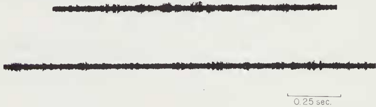
Fig. 3. Sonogram of the substrate-borne vibratory signal produced by a stridulating L. muscorum worker.

analysis of the signal was attempted due to the high signal-to-noise ratio. We were unable to detect any airborne component to this stridulatory vibration. Workers restrained by having an antenna clamped in forceps responded in the same manner as those restrained with glue. Similarly, when a worker was engaged in apparent stridulatory movements, a vibratory signal of the type described above was recorded from the substrate. Thus, the vibratory signal produced by a L. muscorum worker is readily transmitted to the substrate through its legs.